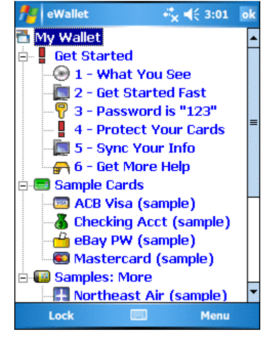
3 Initial Categories Expanded